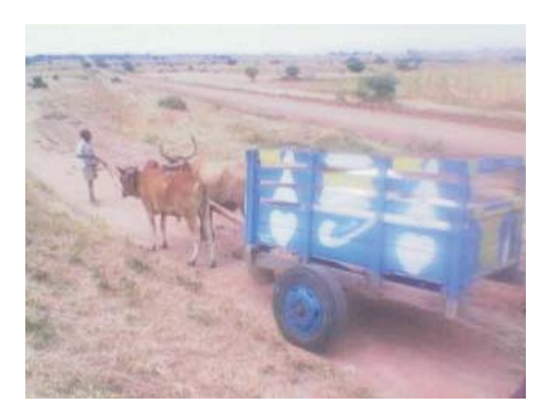
Common means of Transportation for Agric product in Rural Areas