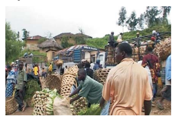
Market is one of the investment option in Tanzania