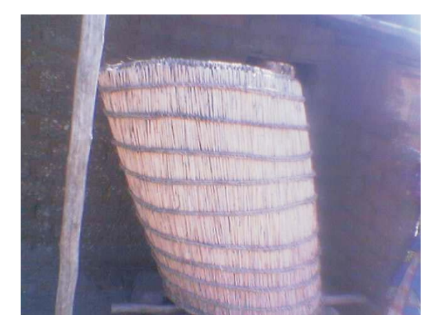
Grain storage in Lake Victoria zone, Tanzania