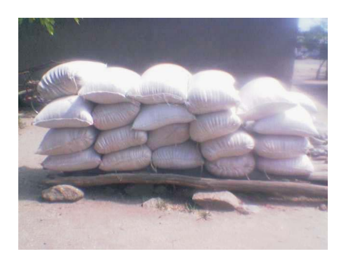
Grain packaging to market/store in Southern Highland Zone