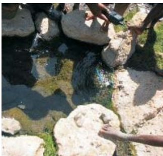
Studying the Songwe River basin, Malawi & Tanzania