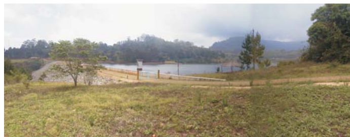
Dam Design in the Mara basin Lake zone Tanzania