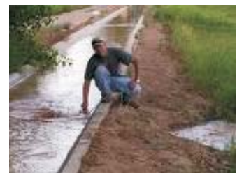
Irrigation in the Usangu basin Southern Highland, Tanzania