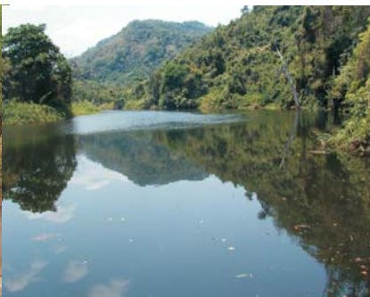
Studying the Mgeta River basin, Morogoro