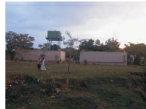
Ground water study, Dar es Salaam, Morogoro & Dodoma